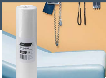
Industry SPECIALIST A tailored range of paper hygiene solutions suitable for specialist industries.