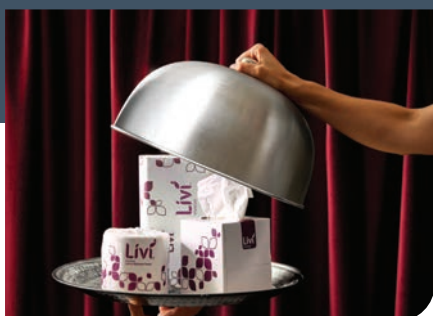
Impressa PREMIUM Premium luxury quality that creates a lasting, personal impression.